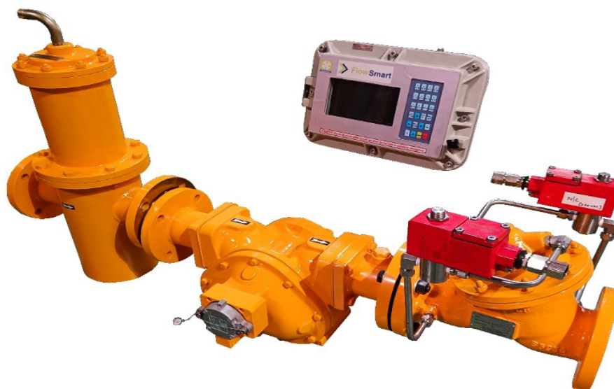
Vermont Taurus Series Meter with FlowSmart Batch Controller